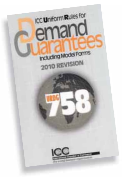
guarantee, and it clearly reflects the international practices followed in this regard.

The URDG, the first in 19 years, is considered the balanced base to regulate the relationship between the beneficiary and the bank issuer of the demand guarantee. It identifies the bank guarantee commitment towards the beneficiary and clarifies the mechanism of the beneficiary claim of his right of the demand